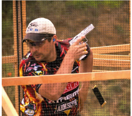
Eric Grauffel (FRA) - World Champion

There are continually new demands to challenge shooting enthusiasts.