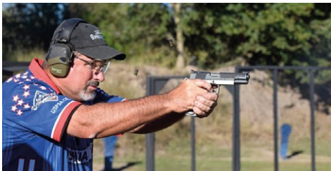
Rob Leatham - IPSC Champion

IPSC World Shoots are the top shooting competitions in the world with more than 1,500 athletes in attendance from around the globe